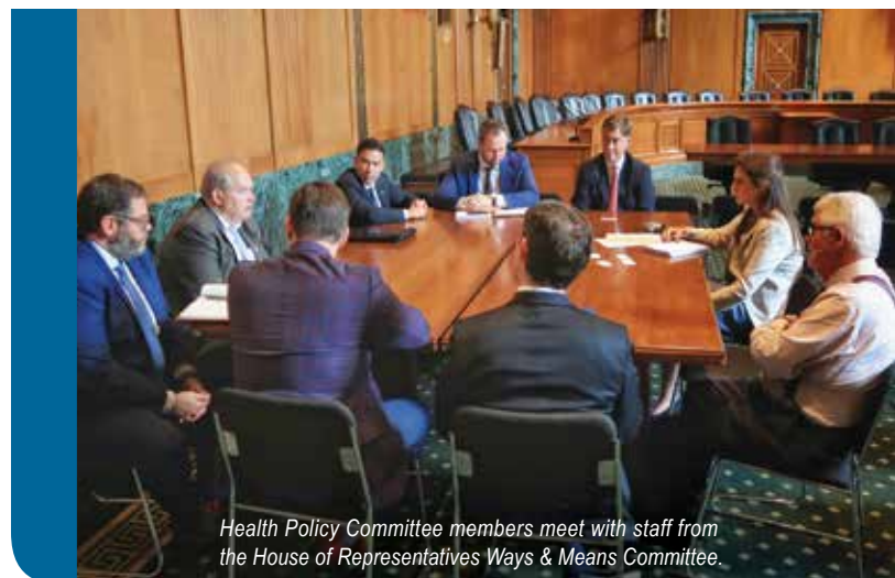
Health Policy Committee members meet with staff from the House of Representatives Ways & Means Committee.